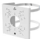
SN-CBK627D Pole Mount